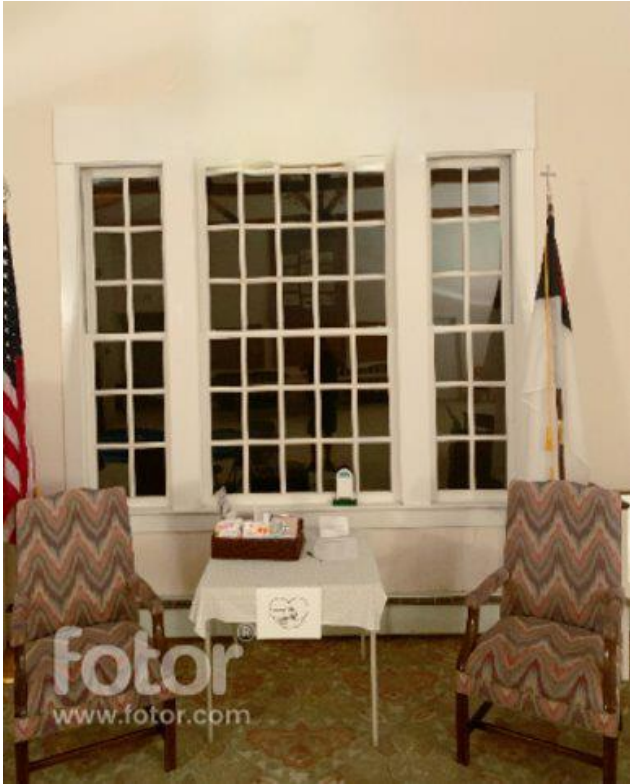
Rendered photo of proposed window design.